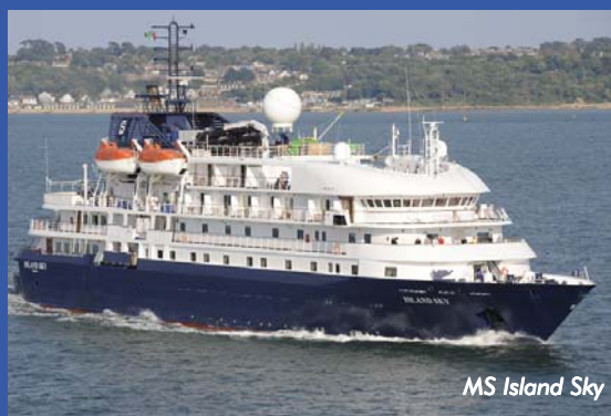
MS Island Sky

Adventurers have two chances to explore the once forbidden Russian White Sea region next year, onboard Wild Earth Travel's newly renovated 116-passenger MS Island Sky .