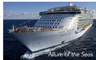
Allure of the Seas