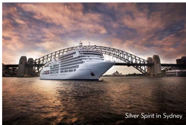
Silver Spirit in Sydney

I strongly recommend this luxury ship for its superior onboard experience, especially the service and dining.