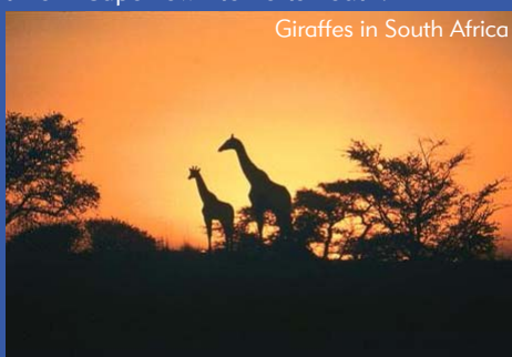
Giraffes in South Africa

For full details on the voyage itinerary, as well as all Athena's offerings visit your travel agent or see www.classicintcruises.com .