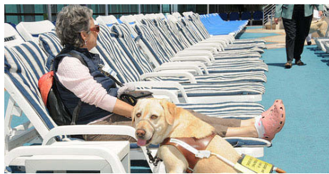
A guide dog warming up to life at sea