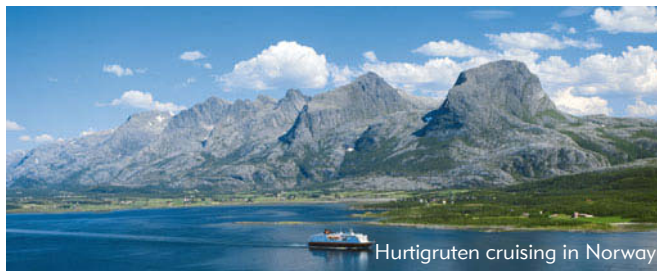
Hurtigruten cruising in Norway

For details, call 1800 623 267 or see your travel agent. 🌐