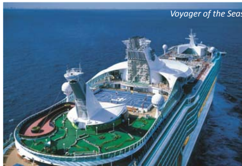
Voyager of the Seas

For more details on Voyager's regional 2012-13 season, visit your local travel agent, or see www.royalcaribbean.com.au .