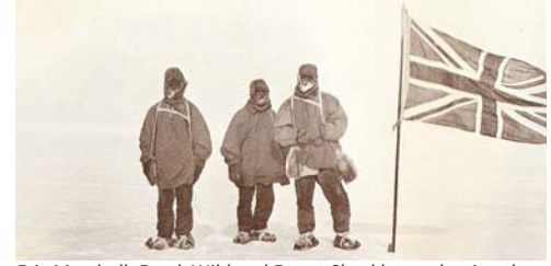
Eric Marshall, Frank Wild and Ernest Shackleton planting the British Flag in Antarctica in 1909.

The full website will officially launch on 14 December, the centenary of Norwegian explorer Roald Amundsen reaching the South Pole.