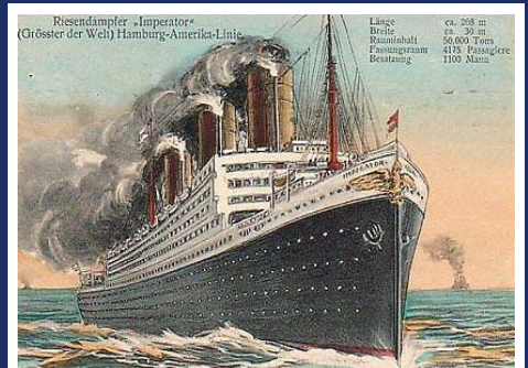
Picture of the brand new Imperator in 1913

Cruise Weekly is Australia's favourite online cruising publication. In production since 2007, Cruise Weekly is published each Tuesday, with a further travel industry update each Thursday.