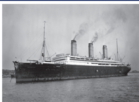
Imperator at anchor 1913

For more detail on SS Imperator , see www.freewebs.com/ultimateimperator .