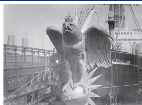
The massive bronze eagle on the bow