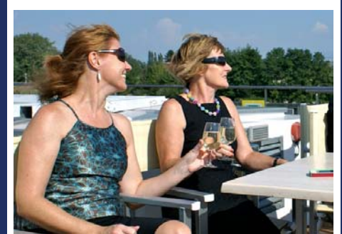
Mum and I enjoy the top deck

Cruise Weekly is Australia's favourite online cruising publication. In production since 2007, Cruise Weekly is published each Tuesday, with a further travel industry update each Thursday.