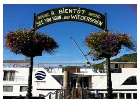
Welcome to wine country