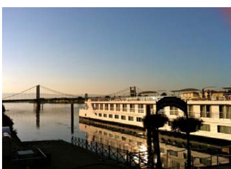
River Royale on the Rhone

For full details see www.uniworldcruises.com.au .