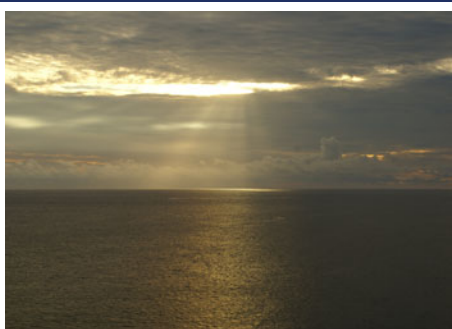
Focus on the horizon

If all else fails, ask the crew for assistance or see the ship doctor.