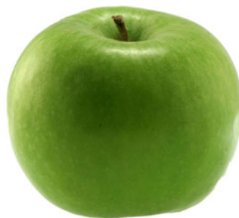
A green apple a day...