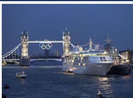
Silver Cloud and the London Olympics