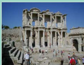
Library of Celsus, Ephesus