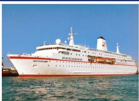
Ms Deutschland hosts the Germans

The contest is being televised in the US and the public can vote for the winner on Facebook.