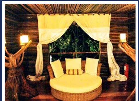
Check-in Amazon style

Cruise Weekly is Australia's favourite online cruising publication. In production since 2007, Cruise Weekly is published each Tuesday, with a further travel industry update each Thursday.