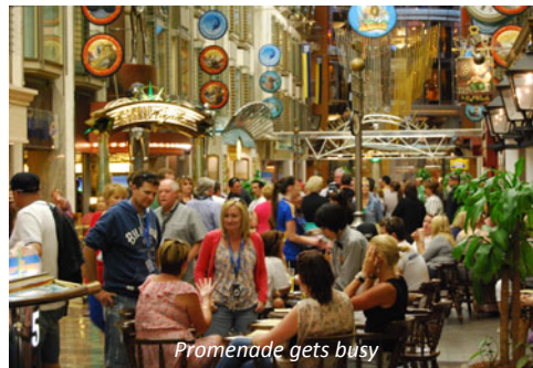
Promenade gets busy

For more info see your local travel agent, or www.royalcaribbean.com.au .