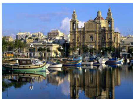
Stunning Maltese harbour

Easter Island's incredible remoteness makes a shipboard visit there unusual and is most often part of a round-the-world itinerary by more adventurous cruise lines. Coming up in 2013 the larger lines Princess, HAL, Oceania and P&O Int'l, while Cunard, Fred.Olsen and Crystal are looking at 2014 - see http://www.chile.travel .