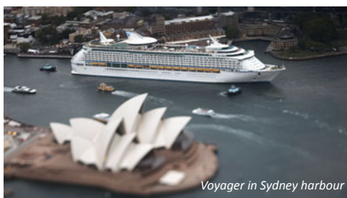
Voyager in Sydney harbour

*Prices based on guaranteed inside cabin, are inclusive of the 35% Last Minute Saving on select voyages between 02 Jan & 13 Feb 2013. Last Minute Fares are strictly limited and may be withdrawn without notice. Travel Agent License: ZTA06929 (Discover the World Marketing Travel trading as Discover the World Cruising)