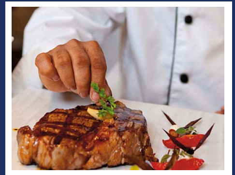
Cooked to perfection