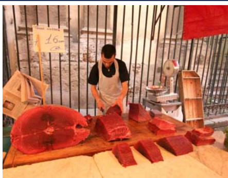
Serious seafood in Palermo

There are around thirty cruise visits to the island annually with P&O, MSC and Silversea the most regular. The main port is Pointe des Galets. Official tourism site: www.reunion.fr/en/ .