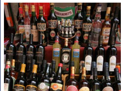
Fancy a tippie? Palermo

Cruise Weekly is Australia's favourite online cruising publication. In production since 2007, Cruise Weekly is published each Tuesday, with a further travel industry update each Thursday.