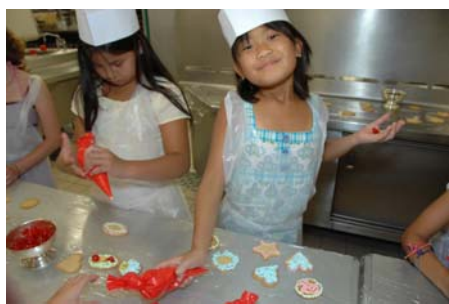
Crystal's cookie classes