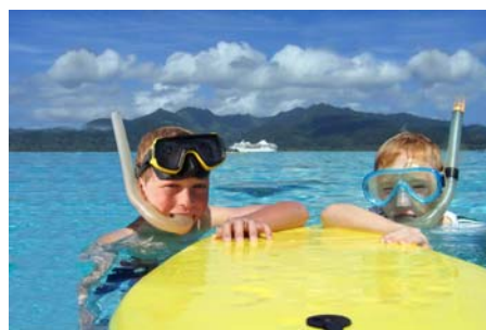
Paul Gauguin's youth program