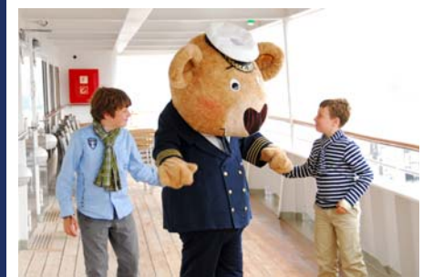
Hapag-Lloyd's Käpt'n Knopf

Cruise Weekly is Australia's favourite online cruising publication. In production since 2007, Cruise Weekly is published each Tuesday, with a further travel industry update each Thursday.