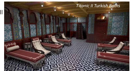
Titanic II Turkish Baths

Despite this, whilst the ship will try to capture the Edwardian romance of Titanic's era, it's machinations will be modern, with a welded hull, diesel power generation, bow thrusters for increased maneuverability and a new hull form below the waterline providing greater stability