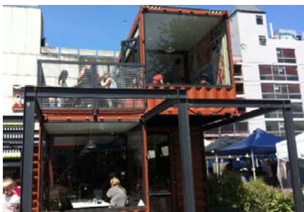
Re:START Mall Cafés

To book Crystal Cruises itineraries in New Zealand, go to www.wiltrans.com.au .