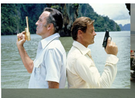
James Bond Phang Nga Bay

More info on Phuket and Thailand: www.thailand.net.au .