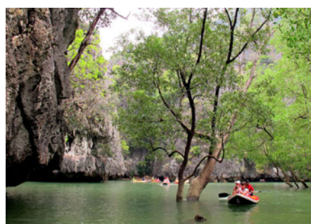
Phang Nga Bay