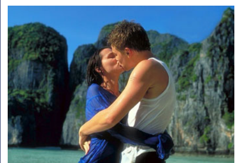
The Beach, Phang Nga Bay

Cruise Weekly is Australia's favourite online cruising publication. In production since 2007, Cruise Weekly is published each Tuesday, with a further travel industry update each Thursday.