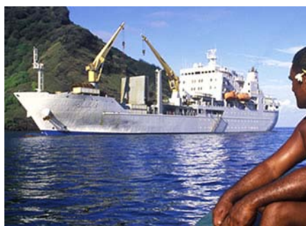
Freighter ship Aranui 3