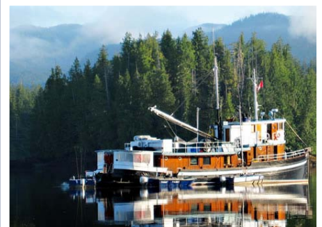
Take a tugboat

Cruise Weekly is Australia's favourite online cruising publication. In production since 2007, Cruise Weekly is published each Tuesday, with a further travel industry update each Thursday.