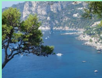
Coastline of Capri