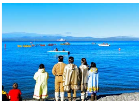
Beringian Arctic Games

Visit www.coralprincess.com.au for more details.