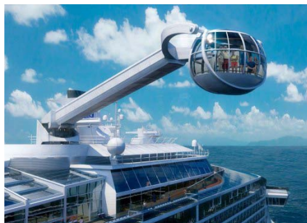
Royal Caribbean's Quantum of the Seas