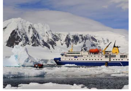
Ocean Nova in Antarctica.