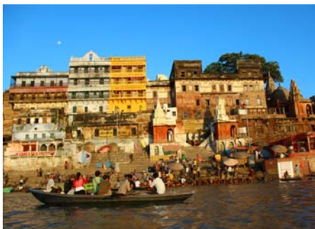
Pilgrimage to Varanasi

For details, see www.haimarktravel.com or contact a travel agent.