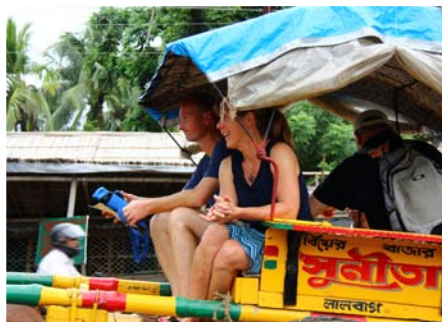
Rickshaw ride through a village