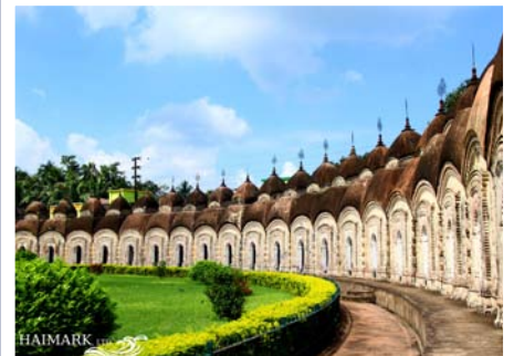
Well maintained religious sites

Cruise Weekly is Australia's favourite online cruising publication. In production since 2007, Cruise Weekly is published each Tuesday, with a further travel industry update each Thursday.