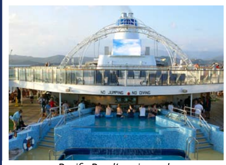
Pacific Pearl's swim-up bar