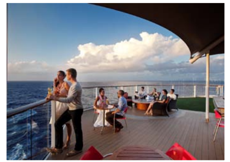
Celebrity Solstice's Sunset bar