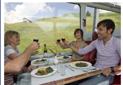
Enjoy fine cuisine while riding the rails

Cruise Weekly is Australia's favourite online cruising publication. In production since 2007, Cruise Weekly is published each Tuesday, with a further travel industry update each Thursday.