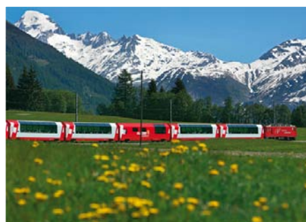
Riding on the Glacier Express