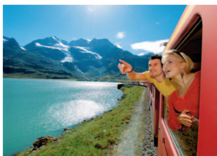
The breathtaking sights are endless