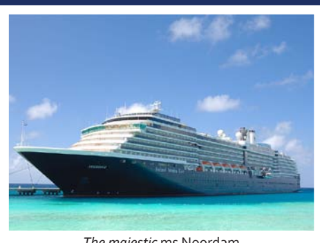
The majestic ms Noordam

Call 1300 987 322 or visit www.hollandamerica.com.au.