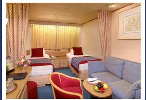
One of Noordam's spacious cabins