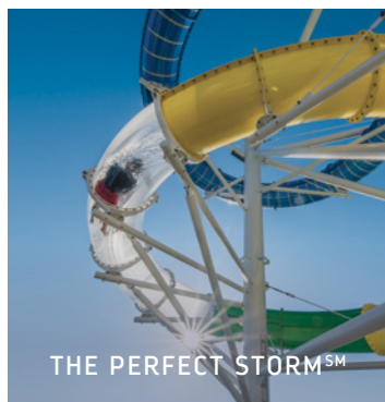
THE PERFECT STORM SM