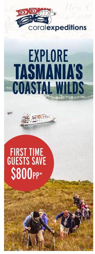
FIND OUT MORE >

"The wharves selected for this trial are not currently serviced by regular ferries so the new On Demand service will help to connect this area to a major transport hub."