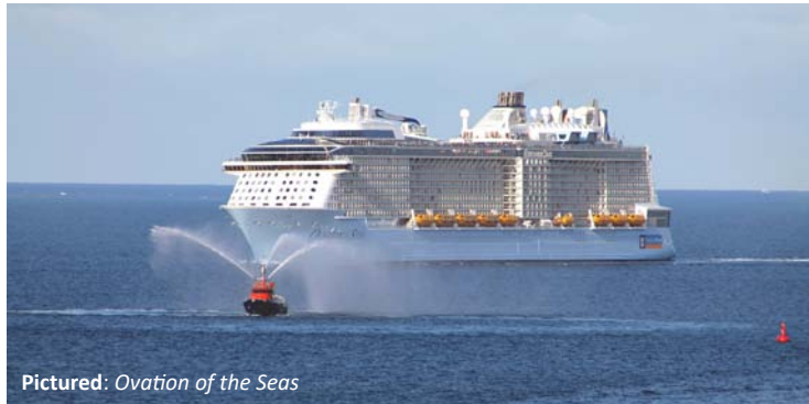
Pictured: Ovation of the Seas

“We were hopeful that a decision will be taken quickly because frankly, already its impinging on the logistics and our ability to bring in the newest and