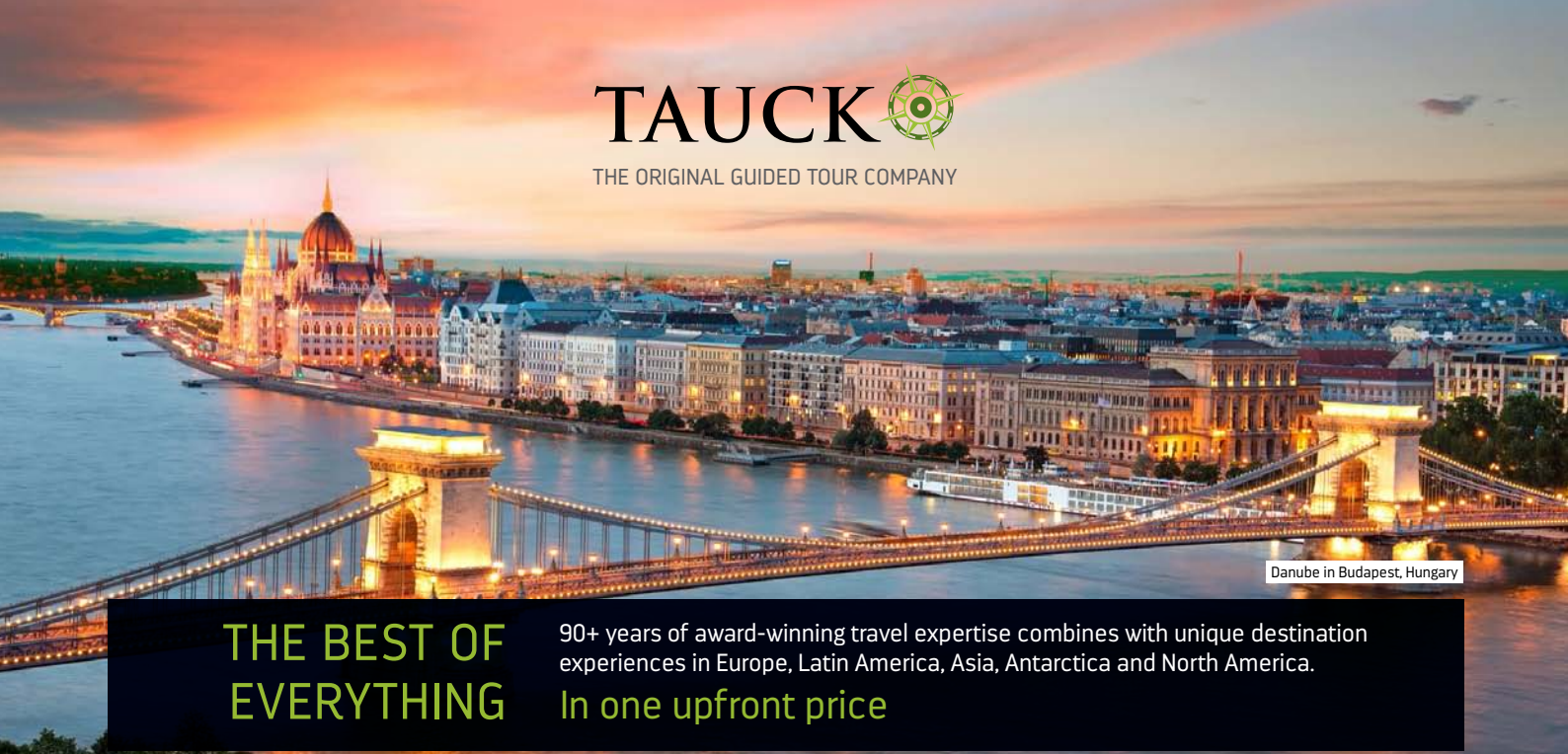
Danube in Budapest, Hungary