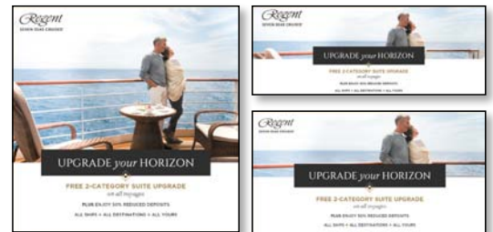
SOCIAL MEDIA TILES