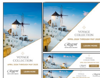
SOCIAL MEDIA TILES