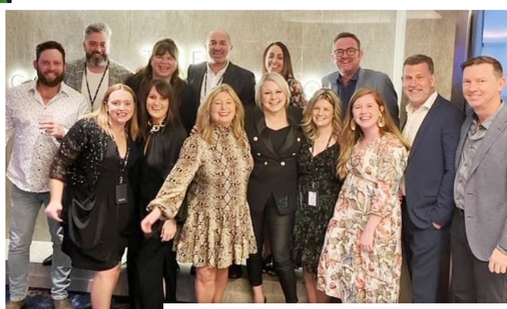
SOME of the Aussie agents on board Prima for the christening.