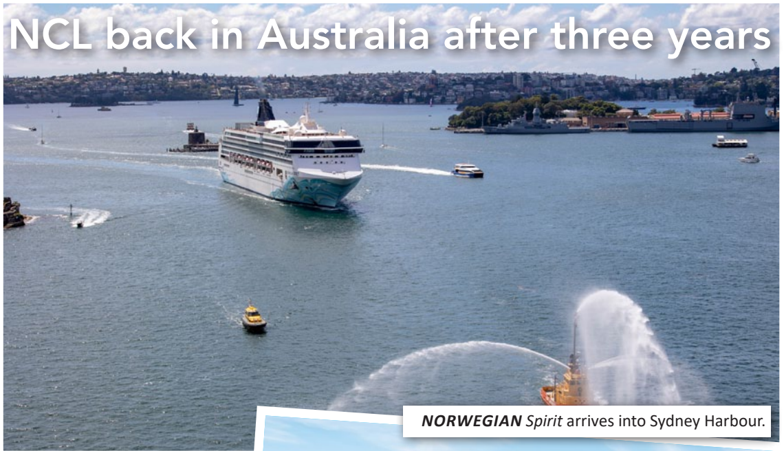
NORWEGIAN Spirit arrives into Sydney Harbour.

"We know Australians love our contemporary, laidback style of cruising, as well as the outstanding value only an NCL cruise can offer."