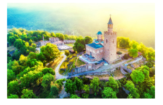
23 DAY | EUROPEAN SOJOURN Amsterdam to Bucharest or v.v. From $7,445pp in Standard stateroom