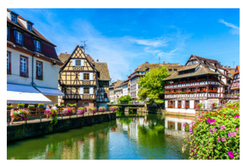
8 DAY | RHINE GETAWAY Amsterdam to Basel or v.v. From $2,695pp in Standard stateroom

For more information contact your Commercial Manager or email agents.anz@vikingcruises.com $ 138 747 $ VIKING.COM $ MYVIKINGJOURNEY.COM/AGENT