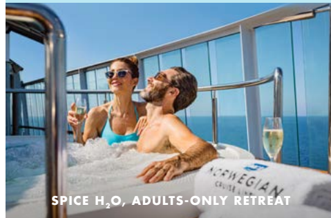
SPICE H 2 O, ADULTS-ONLY RETREAT