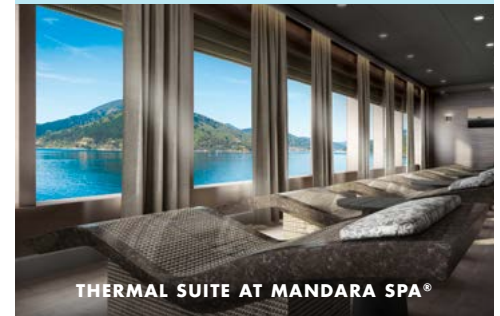
THERMAL SUITE AT MANDARA SPA®

BOOK TODAY & BE REWARDED WITH UP TO AS A PARTNERS FIRST REWARDS MEMBER**.