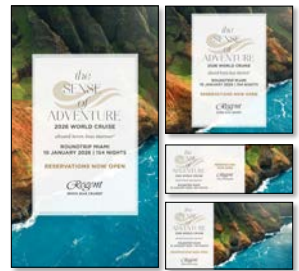
SOCIAL MEDIA BANNERS