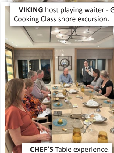
CHEF'S Table experience.