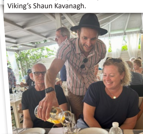
VIKING host playing waiter - Greek Cooking Class shore excursion.