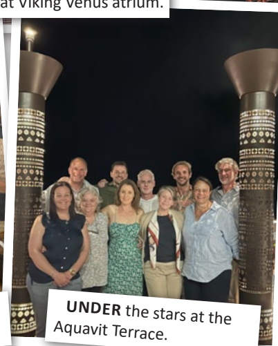
UNDER the stars at the Aquavit Terrace.