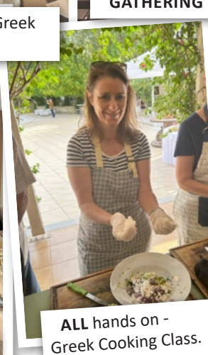
ALL hands on - Greek Cooking Class.