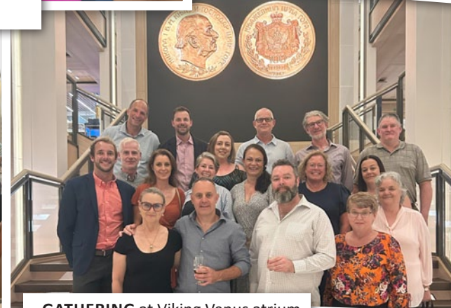
GATHERING at Viking Venus atrium.