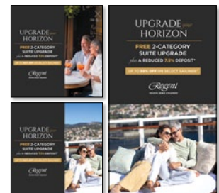
SOCIAL MEDIA TILES