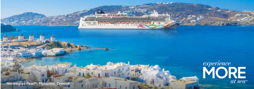
Norwegian Pearl®, Mykonos, Greece

Your clients can immerse themselves in more charm in Northern Europe, witness more iconic sights in the Mediterranean or hop more idyllic islands in the Greek Isles with NCL®. They can take their pick from 11 contemporary ships, sailing from 14 departure ports with over 180 unique itineraries in the 2025/26 seasons. Plus, they can explore even more with longer times in port and many sailings featuring late stays and overnights*.