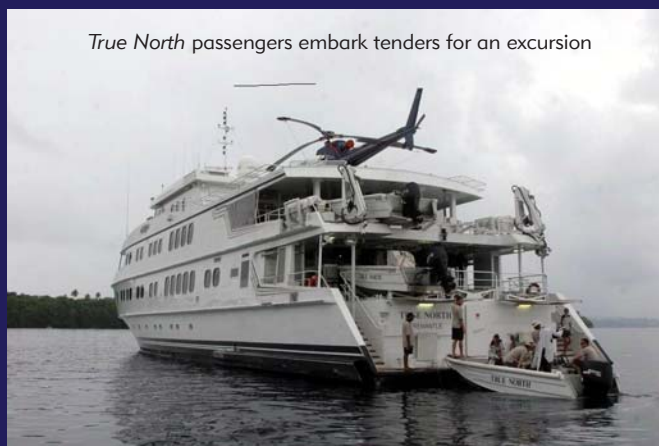
True North passengers embark tenders for an excursion

At time of writing, a repeat of the seven-night Solomons Sojourn for 2011 is unconfirmed, but stay tuned to www.northstarcruises.com.au for updates.