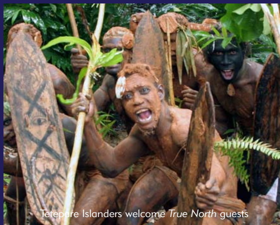
Tetepare Islanders welcome True North guests