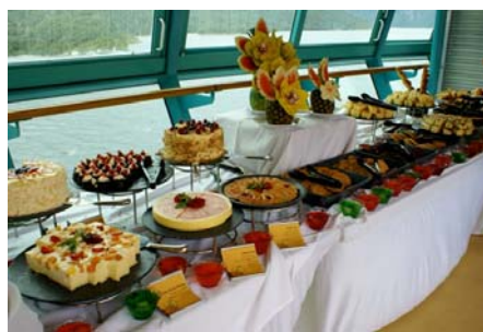
Radiance of the Seas desserts