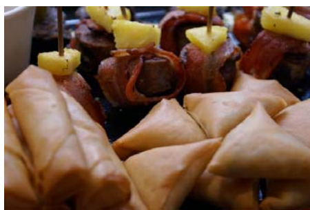
Onboard finger foods are tasty and addictive

6pm: "Oh, it's even better than yesterday. Forget it. I deserve to treat myself. There's only five days left. I'll go on a diet when I get home."