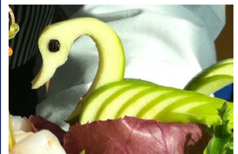
A swan carved out of an apple

Cruise Weekly is Australia's favourite online cruising publication. In production since 2007, Cruise Weekly is published each Tuesday, with a further travel industry update each Thursday.