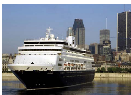
Holland America are regulars in Montreal