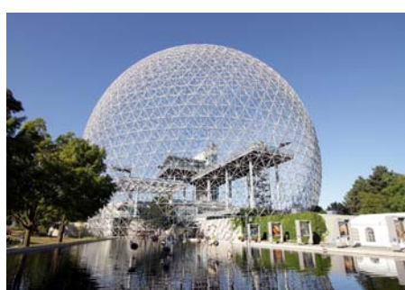
Former 1967 Expo site now Biosphere