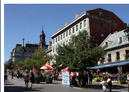
Plenty of history in Old Montreal

Cruise Weekly is Australia's favourite online cruising publication. In production since 2007, Cruise Weekly is published each Tuesday, with a further travel industry update each Thursday.