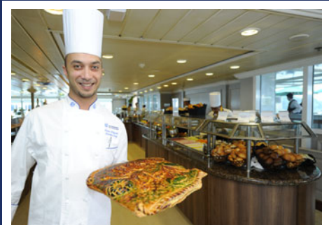
Azamara's gourmet offerings

Cruise Weekly is Australia's favourite online cruising publication. In production since 2007, Cruise Weekly is published each Tuesday, with a further travel industry update each Thursday.