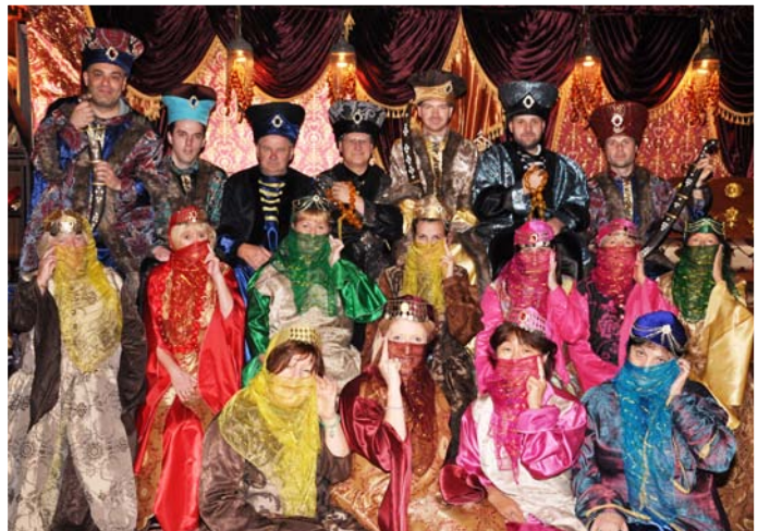
ABOVE: Dressing up in traditional Turkish style in Istanbul.

BELOW : Setting sail aboard a zodiac on one of many daily Mediterranean adventures while cruising on the MS Island Sky.