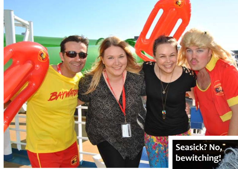
BELOW: These travel agents were blind before the evening even started.

These pictures were taken by CW during the inaugural - lots more on our Facebook page at facebook.com/cruiseweekly.