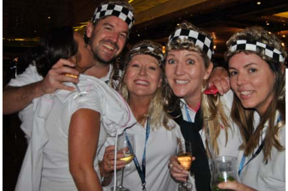
LEFT: No, we're definitely not in Kansas any more. But the company said Carnival Legend has been Aussie-fied, not Oz-ified!

RIGHT : There's nothing like an adult onesie, and there were plenty on display including these sharks.