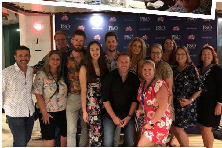
AUSSIE Top Achievers enjoying the Australia Day Deck Party.