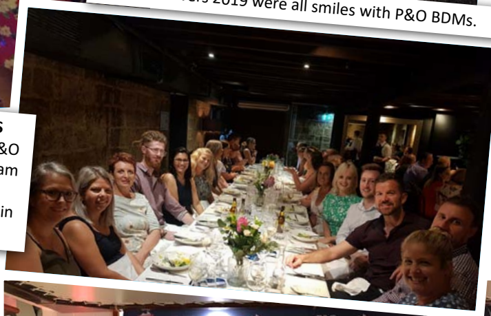
AGENTS and the P&O Cruises team at The Cut Bar & Grill in Sydney.