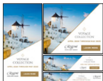
SOCIAL MEDIA TILES