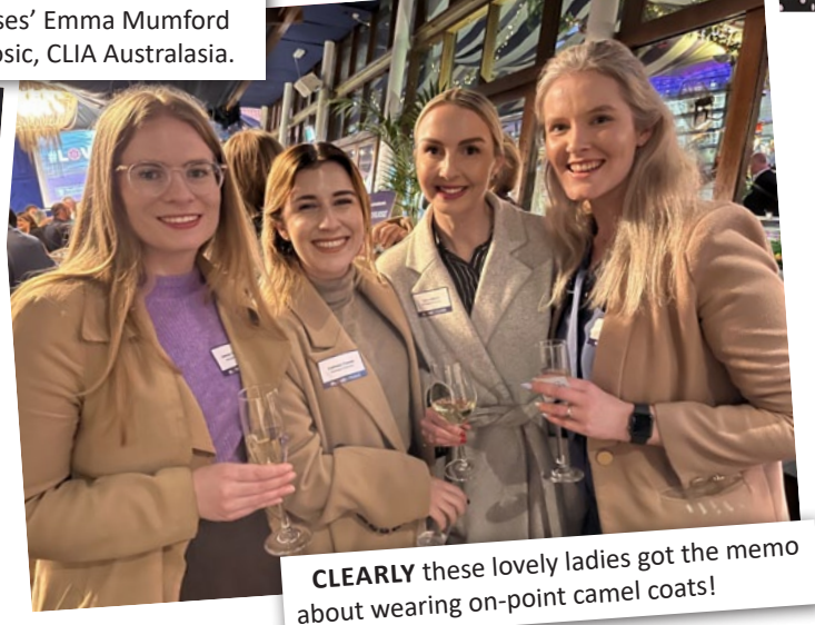
CLEARLY these lovely ladies got the memo about wearing on-point camel coats!