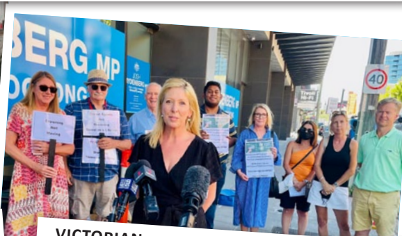
VICTORIAN cruise stakeholders gather outside the office of Federal Treasurer Josh Frydenberg.