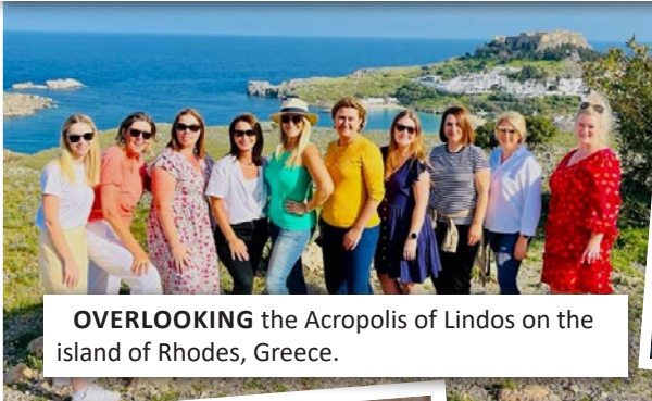
OVERLOOKING the Acropolis of Lindos on the island of Rhodes, Greece.