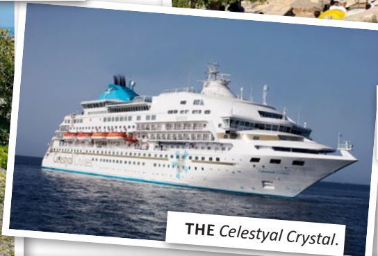
THE Celestyal Crystal.