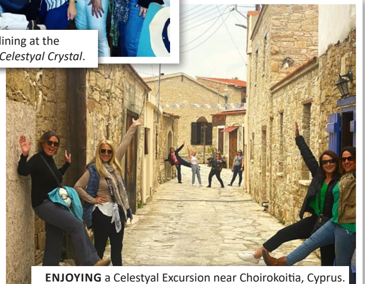
ENJOYING a Celestyal Excursion near Choirokoitia, Cyprus.