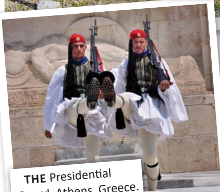
THE Presidential Guard, Athens, Greece.