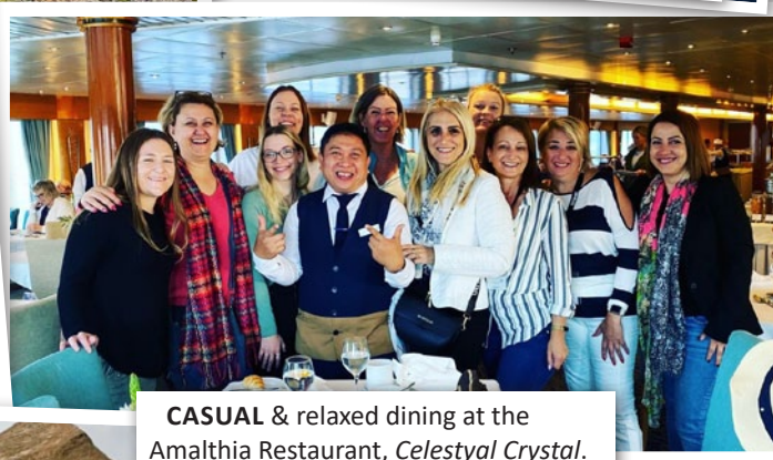
CASUAL & relaxed dining at the Amalthia Restaurant, Celestyal Crystal.