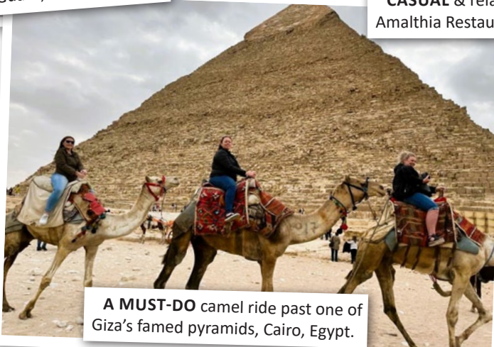
A MUST-DO camel ride past one of Giza's famed pyramids, Cairo, Egypt.