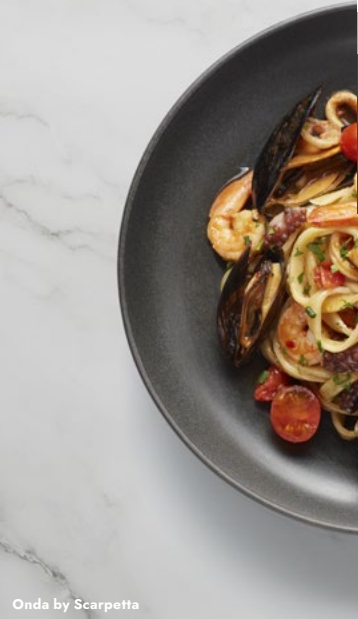
Onda by Scarpetta