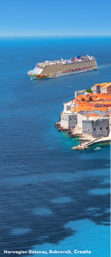
Norwegian Getaway, Dubrovnik, Croatia