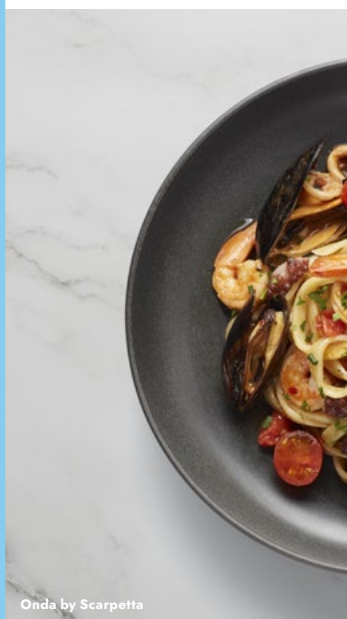
Onda by Scarpetta

FREE BEVERAGE PACKAGE* FREE SPECIALTY DINING PACKAGE* FREE SHORE EXCURSIONS CREDIT* FREE WIFI PACKAGE* 3 RD AND 4 TH GUEST SAIL AT A REDUCED RATE*