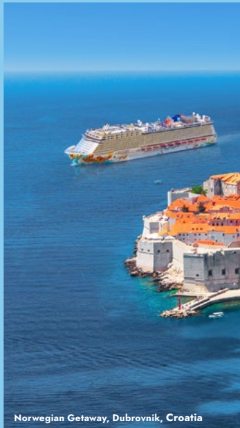
Norwegian Getaway, Dubrovnik, Croatia