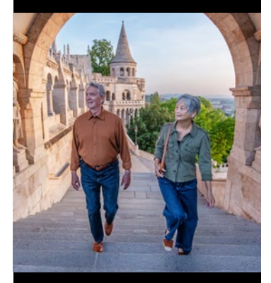
Call 138 747 to book or visit viking.com/travel-advisor to book online and download assets.

For a limited time save up to 30% on selected river and ocean voyages. Book by 30 June 2025*.