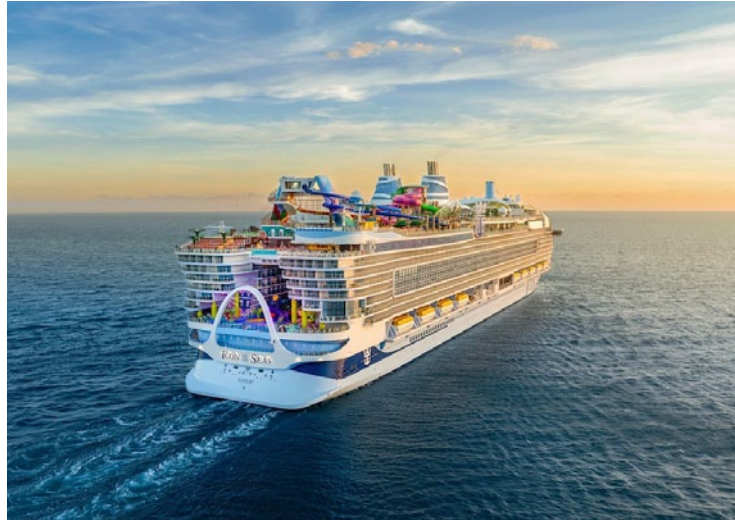
ABB has signed a 15-year fleet service agreement with Royal Caribbean Group to enhance the fleet's efficiency and strengthen its decarbonisation.

The agreement includes preventive maintenance and digital solutions, as well as optimising propulsion operations for Royal Caribbean's 33 ships equipped with Azipods.