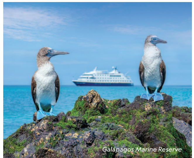
Galápagos Marine Reserve

Embark on an unforgettable journey to the Galápagos, where nature takes centre stage. Snorkel in the pristine waters of the Galápagos Marine Reserve or set out on foot across volcanic landscapes to encounter rare and fearless wildlife - from playful sea lions to the iconic Galápagos Penguin - all thriving in their untouched natural habitat.