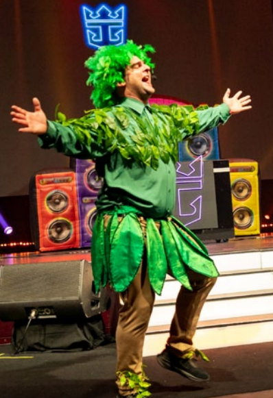
TIKTOK superstar The Tree of Wisdom showing the crowd why he is a viral success.