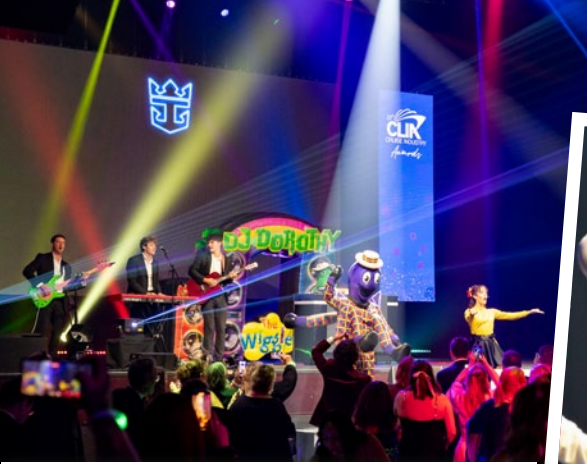
THE Wiggles pumping up the CLIA afterparty.

The afterparty entertainment highlighted what guests may expect on board Quantum of the Seas, sailing 06 Apr from Brisbane to Sydney, as well as the six Wiggly Friends sailings during the 2025-2026 Australian season.